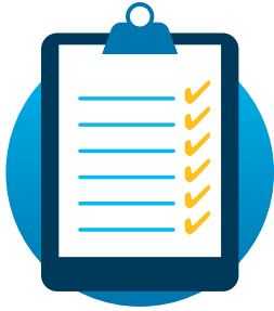
Public Policy User