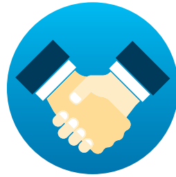
National Or Local Public Client/ Procurer User